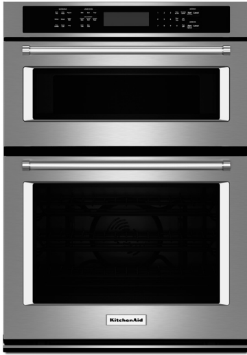
Stainless Steel KOCE500ESS