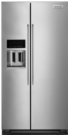
Stainless Steel KRSC503ESS