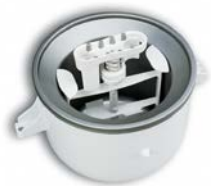
KitchenAid® Ice Cream maker Model No. KICA0WH

Purchase a qualifying KitchenAid® Stand Mixer* and receive a FREE Ice Cream Maker (a $79.99 value) by mail.