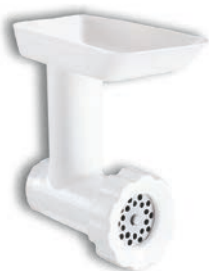
KitchenAid® Food Grinder Model FGA

Purchase a qualifying KitchenAid® Stand Mixer* and receive a FREE Food Grinder (a $64.99 value) by mail.